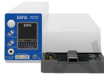
Minimized thermal chamber for industry's fastest thermal cycling