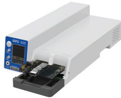
Easy-to-replace MCB in direct contact with BERT